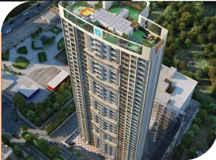
Raunak Supreme Thane