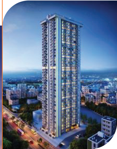
Jay Construction Kharegaon