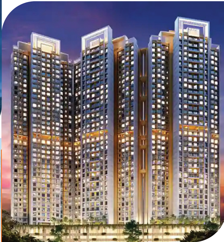
Raunak Bliss Maximum City Thane