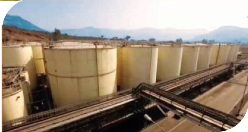
AAAK Kamani Oil Factory Khopoli