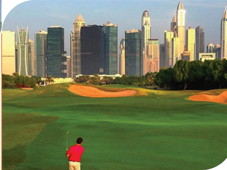
Golf Green View Residential Africa