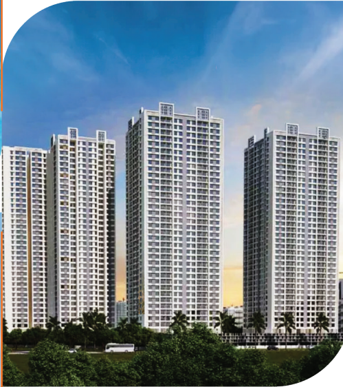
DOSTI Amber Sapphire Shilphata