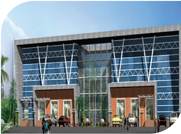
Sokerico Commercial Project Africa