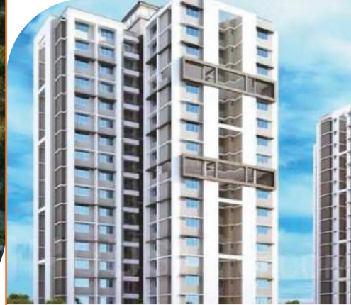
Raunak Unnati Woods F1 & F2 Thane