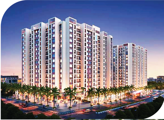
Charms Global City Ambernath