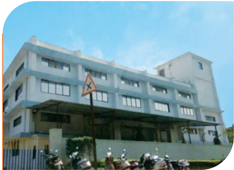
DiaSys Dignostics India Pvt Ltd Mhape