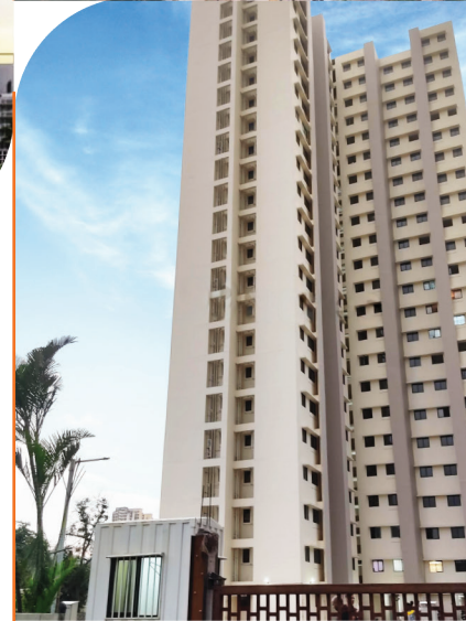
Raymond Realty Thane