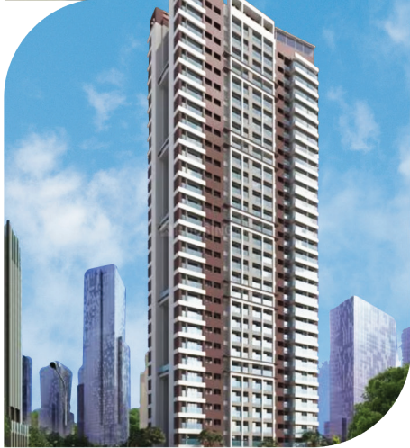
Sandesh Heights Thane