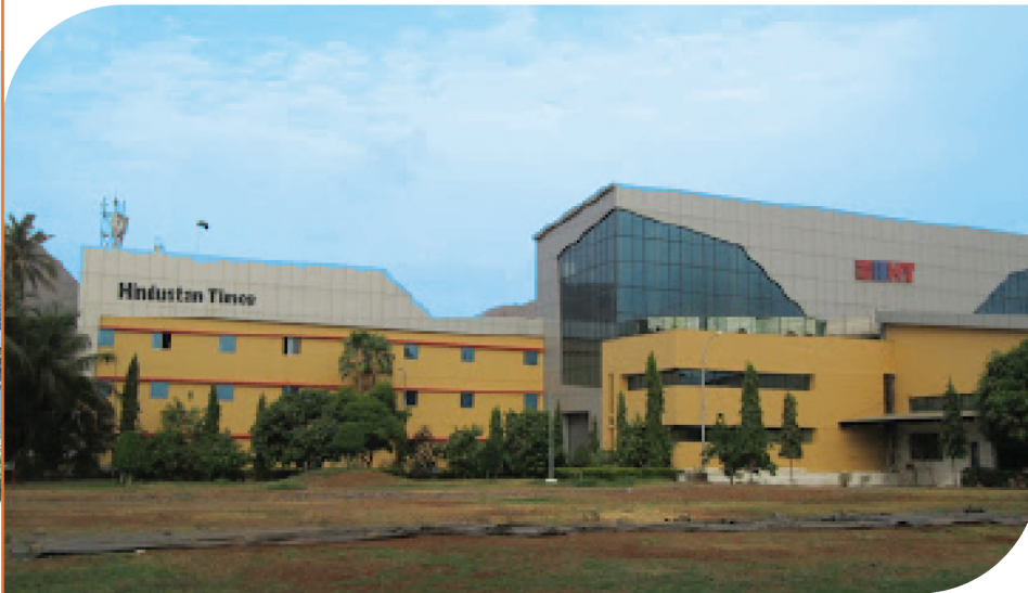
HT Media Ltd. Airoli