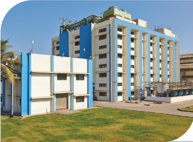
SH Kelkar & Co. Ltd Factory Mulund